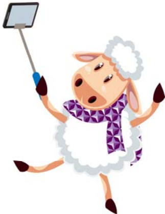
PHOTO CONTEST 2020